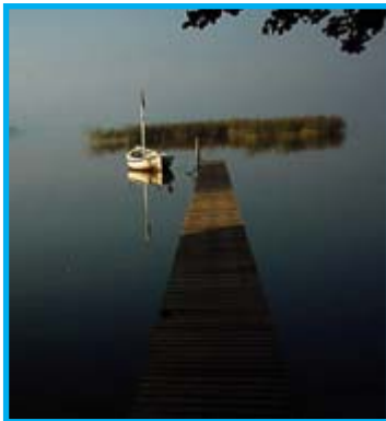
Gryphon is located in beautiful tranquil surroundings.

Every Gryphon design has been built to cruise effortlessly through even the most demanding musical passages, regardless of volume level, with a musical presentation defined by supreme articulation and immediacy, subtle dynamic shading and razor-sharp focus. Refinement and delicacy are combined with power and authority for a natural, involving listening experience.