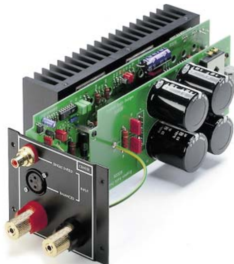
Typical Gryphon module

The mechanical design of the cabinet and assembly methods are all carefully calculated to ensure minimal resonance, either through the use of mechanically grounded high mass or decoupling. Vibration-sensitive components, capaci-