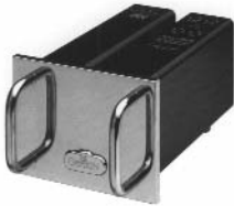
The Gryphon Head Amp 1985

Gryphon Audio Designs was founded in 1985 as an offshoot of 2R Marketing. The first product, the now legendary Gryphon Head Amp, grew from a one-off spare time project developed only for the designers' own home systems. Although the Gryphon project was initially strictly a