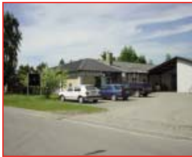
Gryphon Audio Designs in the outskirts of the small town of Ry

In every Gryphon product, form follows function in a unique synthesis of aesthetics and practicality. Gryphon stands for sophisticated technology with a high standard of industrial finish that also incorporates the best of